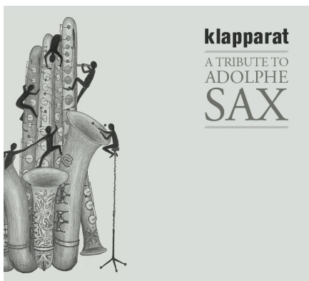
a tribute to Adolphe Sax 2014